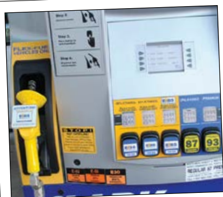
A flex-fuel pump providing numerous ethanol fuel options