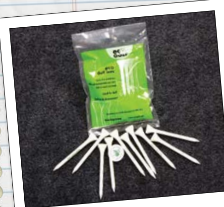
Golf Tees from Eco Golf

Where to buy: Online at www.ecogolf.com or through your promotional products specialist.