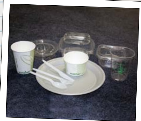
Biodegradable Plate, Cold Cup, Hot Cup, Storage Containers and Cutlery

Corn has long been a table-top favorite and staple for meals, but it can now play a very different role. With the development of corn-based plastics, those tables can now be set using corn-based foodservice products, including plates, cups, silverware, etc.