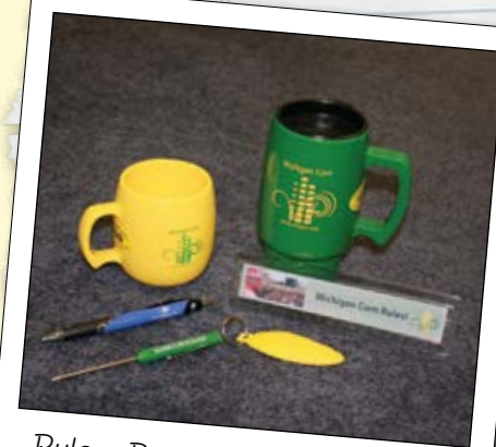
Ruler, Pen, Screwdriver, Key Chain and Coffee Mugs made from corn-based plastic

Where to buy: Online at www.brenmarco.com , www.bioselect.com , www.ecoproducts.com or www.f-k.com . Some products may also be purchased at Gordon Food Service.