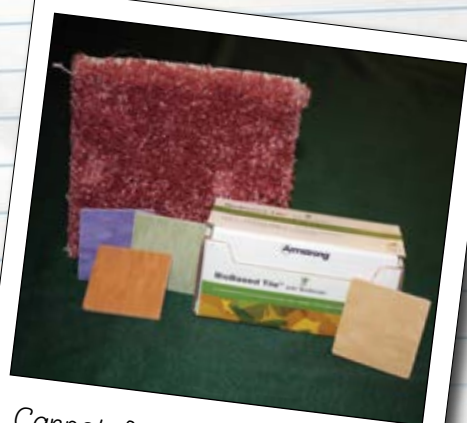
Carpet from Mohawk and tile from Armstrong

Where to buy: Online at www.corncarpet.com . Brands include Mohawk Flooring's SmartStrand carpet and Armstrong's BioBased tile.