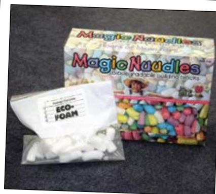
Packing Peanuts and Magic Nuudles

Where to buy: Packing peanuts can be purchased at www.uline.com , Office Depot or Staples. Magic Nuudles, also known as Enviro-Blox, are available at Hobby Lobby and other craft stores. They can also be purchased online from www.magicnuudles.com or www.amazon.com .