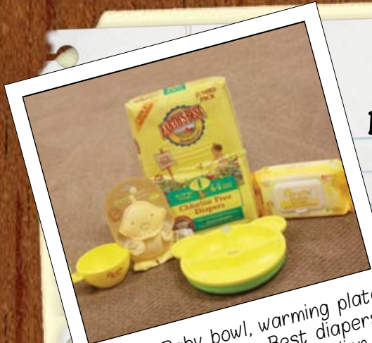
Giraffe Baby bowl, warming plate and wipes; Earth's Best diapers; and teether from Dandelion.