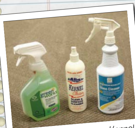
Green Works Cleaner, Kernel Clean and BioRenewables Glass Cleaner

Where to buy: Online at www.ecos.com or www.spartanchemical.com . Green Works brands can be purchased at most supermarkets and BioRenewables Cleaners can be purchased through Spartan Chemical distributors.