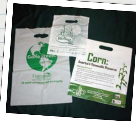
Biodegradable Tradeshow, Trash and Shopping Bags

Where to buy: Tradeshow bags can be purchased online at www.roplast.com . Trash and pet waste bags can be bought online at www.ecoproducts.com and www.biobagusa.com as well as through most natural food stores.