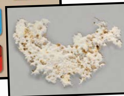
After 40 days