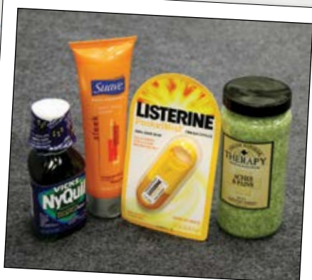
Cold Medicine, Anti-Frizz Cream, Breath Freshener and Bath Salts

Where to buy: Visit www.ethanolretailer.com to find a flex-fuel station near you. In addition, more than 95% of Michigan's gasoline contains at least 10% ethanol.